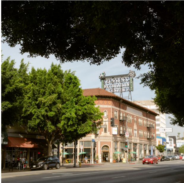
The historic Jensen's Recreation Center on Sunset Blvd