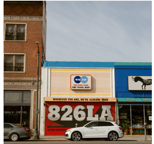
Shops along Sunset Blvd