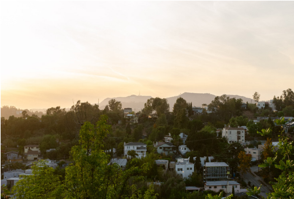
Rise and shine above Echo Park