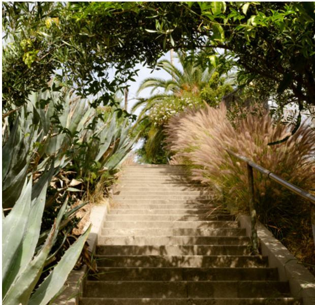
One of Echo Park's many stairs connecting streets and hills