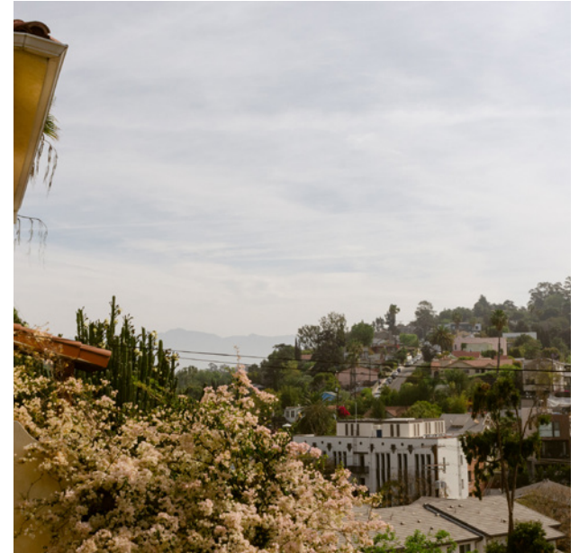
Flora and views along Echo Park's residential streets