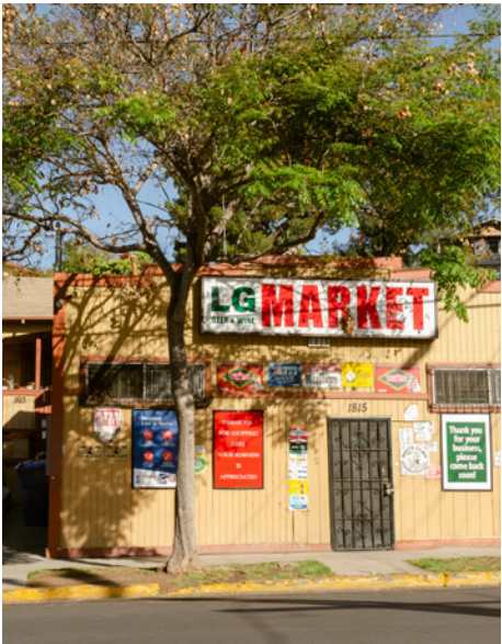
LG Beer & Wine Market