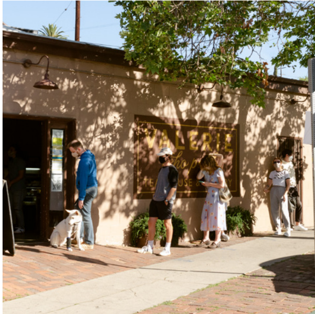
The morning queue at Valerie Confections