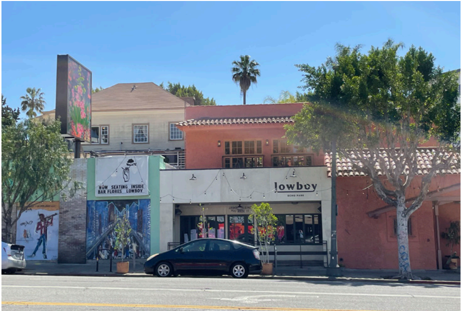
Lowboy on Sunset Blvd